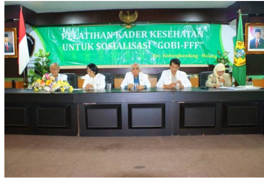
Discussion session with all presenters