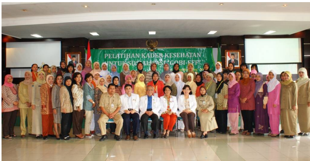
The 2 nd Group participants of the VHM's training (on 9 th , 10 th Juni 2009)