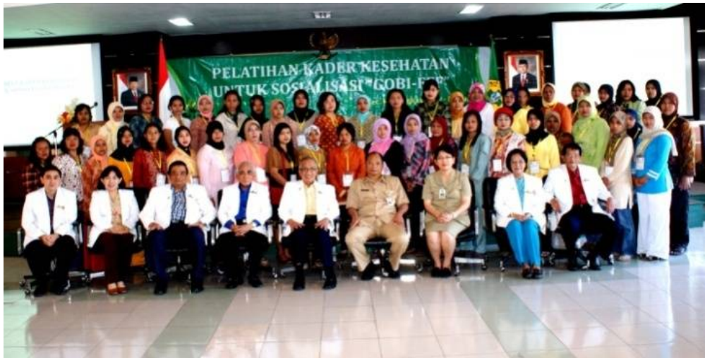
The 1 st Group participants of the VHM's training (on May 4 th , 5 th 2010)