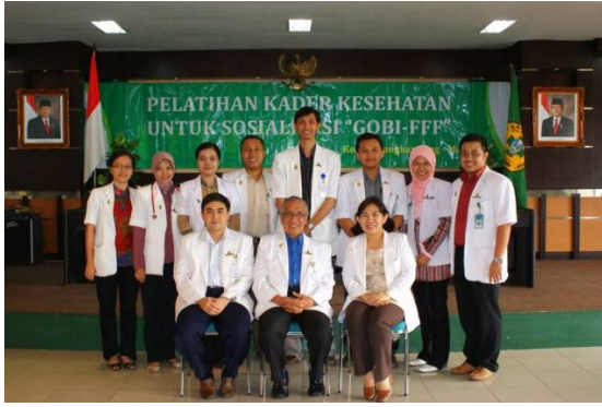
The Working Group Personnel