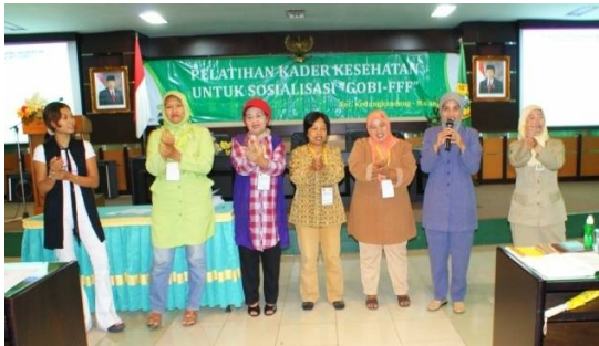
Closing and Feedback