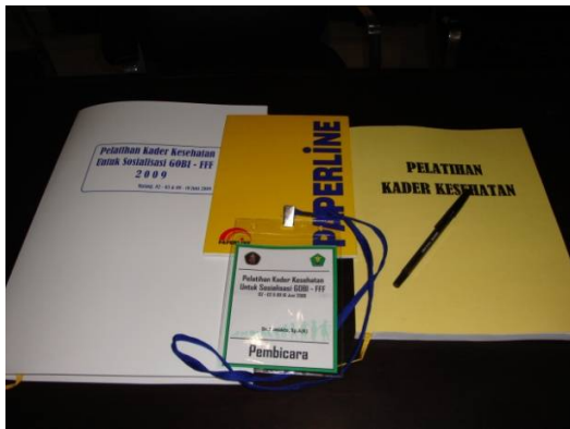
The Seminar Kits